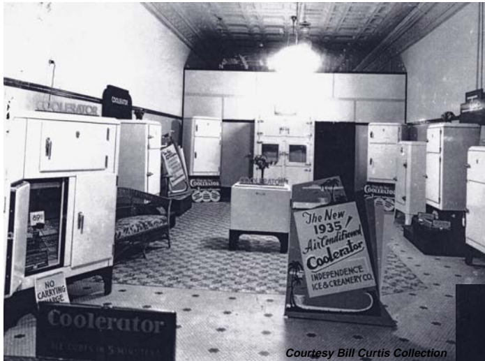
During the Great Depression, up to one-quarter of the Independence work force was unemployed. Those who did have jobs increased their electric power demand with the purchase of electric appliances then flooding the market. Electric refrigerators await buyers on the showroom floor at the Coolerator Store on North Liberty.

One of Sermon's first tasks when he took over as mayor of Independence in 1924 was to propose building a new power plant.